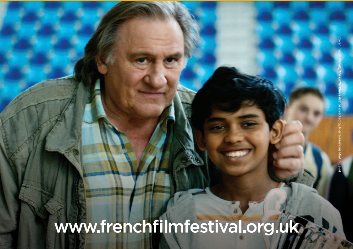
Cover image: Fahim: The Little Chess Prince directed by Pierre-François Mestral-Laval